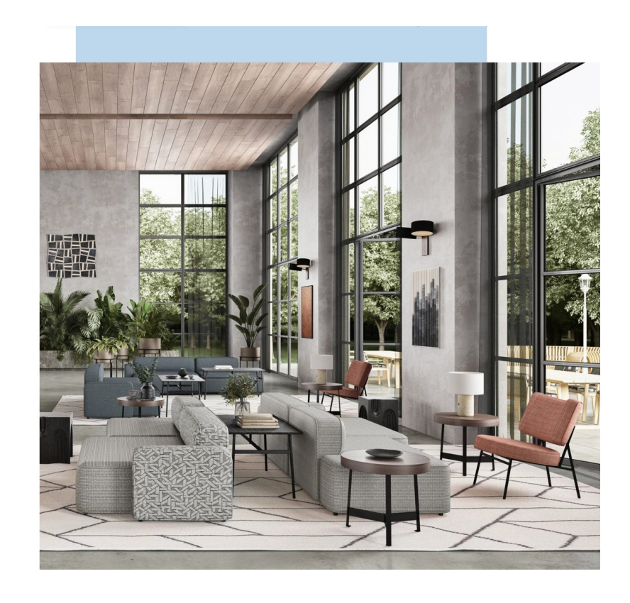
Fabric - FibreGuard - Cleaning methods