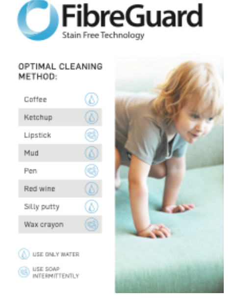
Fabric - FibreGuard - Characteristics