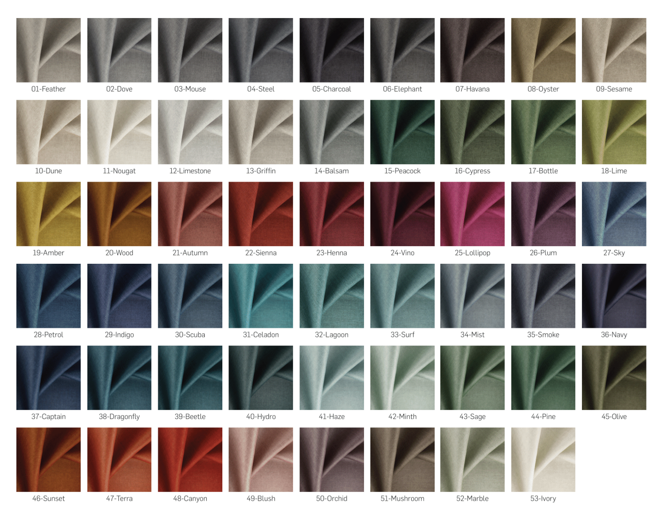
Fabric - FibreGuard - Adventages